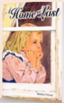
A rare children’s book suitable for the whole family to enjoy!