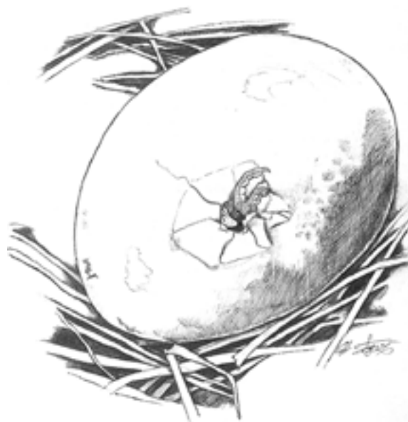
The miracle of life is evident to all who have observed the “simple” example of a chick hatching from its egg after just 21 days; a marvelous testimony to a Master Designer!