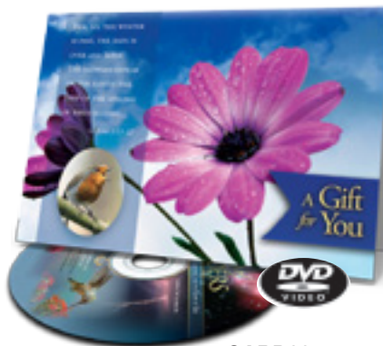
CARD02 5 greeting cards wt .4 $20.00

Each 5x7 high-quality greeting card includes a full-length multilingual DVD program! These special cards are wholesale priced "by design" — Minimum orders of five. (Sorry, no returns on this item, regardless of quantity. Cards are not sold individually and are not packaged for resale.)