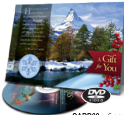
CARD03 5 greeting cards wt .4 $20.00

BACK IN TIME FOR THE HOLIDAYS! These beautiful greeting cards not only praise our Creator in picture and verse but also double as an affordable and meaningful gift for friends and family. The cards, printed on glossy card stock, feature an inspiring winter or spring scene and passage from Psalm 147:16-18 (winter card) or Song of Songs 2:11-13 (spring card). Packaged inside both cards is the breathtaking DVD God of Wonders (multi-language), along with space for writing a personalized message. Envelopes are included for your mailing convenience (requires extra postage). To preview the God of Wonders DVD visit: www.thebereancall.org/product/dvd036